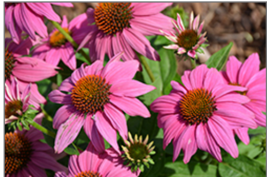
PowWow Wild Berry Coneflower flowers