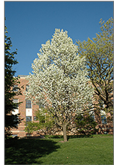
Mountain Frost Pear in bloom

Mountain Frost Pear is recommended for the following landscape applications;