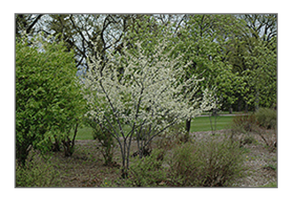
Waneta Plum in bloom