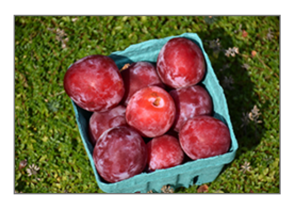
Waneta Plum fruit