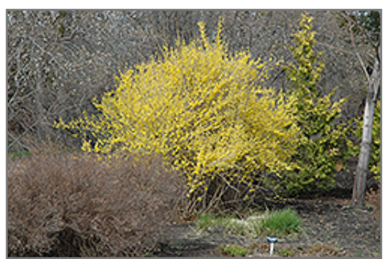
Northern Gold Forsythia in bloom