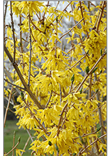
Northern Gold Forsythia flowers

Wagner Nursery, Belgrade 220 Kendall Ct. Belgrade, MT 59714 (406) 388-2559