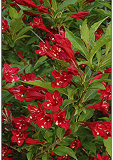
Red Prince Weigela flowers