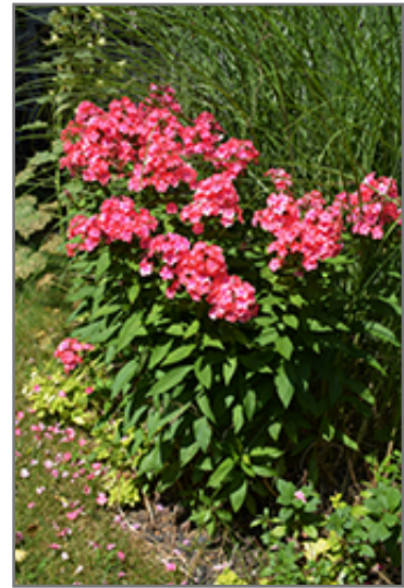
Flame Coral Garden Phlox in bloom