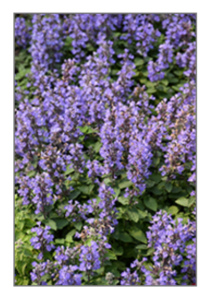
Purrsian Blue Catmint flowers