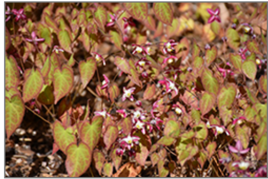
Bishop's Hat in bloom

Bishop's Hat will grow to be about 12 inches tall at maturity, with a spread of 18 inches. When grown in masses or used as a bedding plant, individual plants should be spaced approximately 15 inches apart. Its foliage tends to remain dense right to the ground, not requiring facer plants in front. It grows at a medium rate, and under ideal conditions can be expected to live for approximately 10 years.