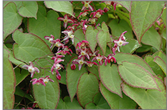
Bishop's Hat flowers

Bishop's Hat is recommended for the following landscape applications;