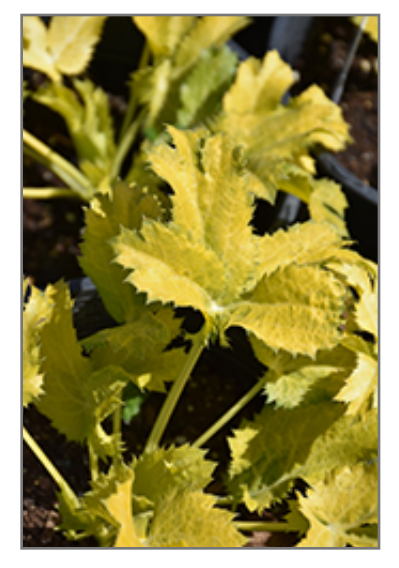
Neptune's Gold Sea Holly foliage