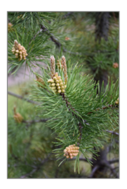
Lodgepole Pine foliage