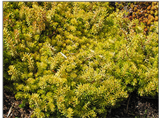
Angelina Stonecrop