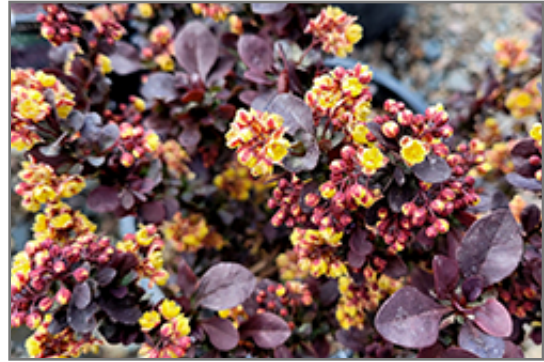
Concorde Japanese Barberry flowers

Concorde Japanese Barberry will grow to be about 18 inches tall at maturity, with a spread of 24 inches. It tends to fill out right to the ground and therefore doesn't necessarily require facer plants in front. It grows at a slow rate, and under ideal conditions can be expected to live for approximately 20 years.