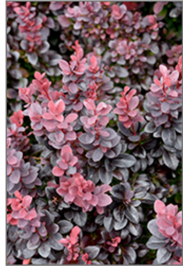
Concorde Japanese Barberry foliage

Concorde Japanese Barberry is recommended for the following landscape applications;