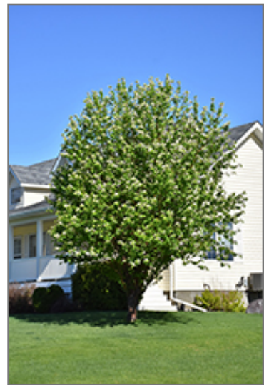
Amur Cherry