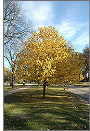
Amur Cherry in fall

This tree should only be grown in full sunlight. It does best in average to evenly moist conditions, but will not tolerate standing water. It is not particular as to soil type or pH. It is somewhat tolerant of urban pollution. This species is not originally from North America.