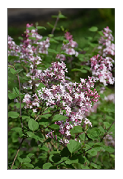
Flowerfesta Pink Dwarf Lilac flowers

Wagner Nursery, Butte 33 Holliday Dr. Butte, MT 59701 (406) 782-5855