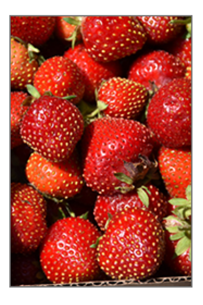
Fort Laramie Strawberry fruit

Fort Laramie Strawberry is a good choice for the edible garden, but it is also well-suited for use in outdoor pots and containers. Because of its spreading habit of growth, it is ideally suited for use as a 'spiller' in the 'spiller-thriller-filler' container combination; plant it near the edges where it can spill gracefully over the pot. Note that when growing plants in outdoor containers and baskets, they may require more frequent waterings than they would in the yard or garden. Be aware that in our climate, most plants cannot be expected to survive the winter if left in containers outdoors, and this plant is no exception. Contact our experts for more information on how to protect it over the winter months.