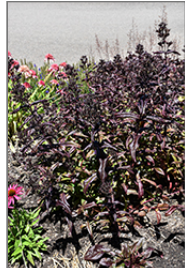
Dakota Burgundy Beard Tongue

Dakota Burgundy Beard Tongue is a fine choice for the garden, but it is also a good selection for planting in outdoor pots and containers. With its upright habit of growth, it is best suited for use as a 'thriller' in the 'spiller-thriller-filler' container combination; plant it near the center of the pot, surrounded by smaller plants and those that spill over the edges. Note that when growing plants in outdoor containers and baskets, they may require more frequent waterings than they would in the yard or garden. Be aware that in our climate, most plants cannot be expected to survive the winter if left in containers outdoors, and this plant is no exception. Contact our experts for more information on how to protect it over the winter months.