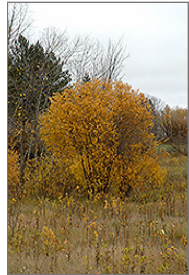
Pussy Willow in fall

This shrub does best in full sun to partial shade. It is quite adaptable, preferring to grow in average to wet conditions, and will even tolerate some standing water. It is not particular as to soil type or pH. It is somewhat tolerant of urban pollution. This species is native to parts of North America.