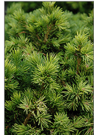
Tompa Dwarf Spruce foliage