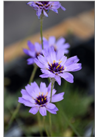
Cupid's Dart flowers

Cupid's Dart is recommended for the following landscape applications;