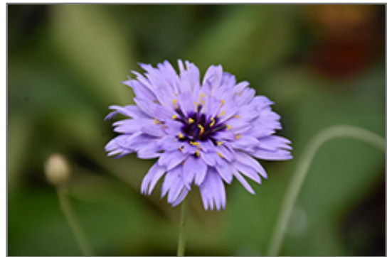
Cupid's Dart flowers