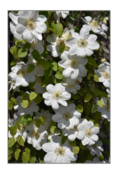
Guernsey Cream Clematis flowers