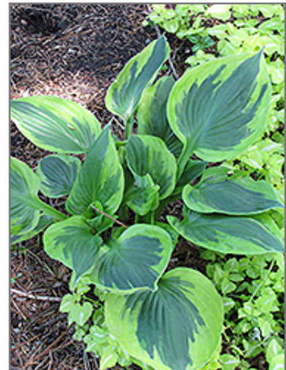
Twilight Hosta