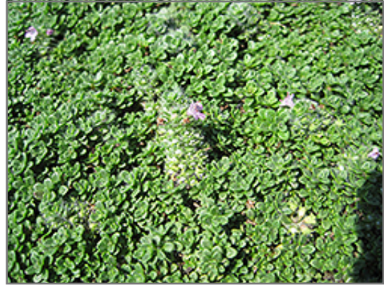
Elfin Creeping Thyme in bloom

This plant will require occasional maintenance and upkeep, and is best cleaned up in early spring before it resumes active growth for the season. Deer don't particularly care for this plant and will usually leave it alone in favor of tastier treats. Gardeners should be aware of the following characteristic(s) that may warrant special consideration;