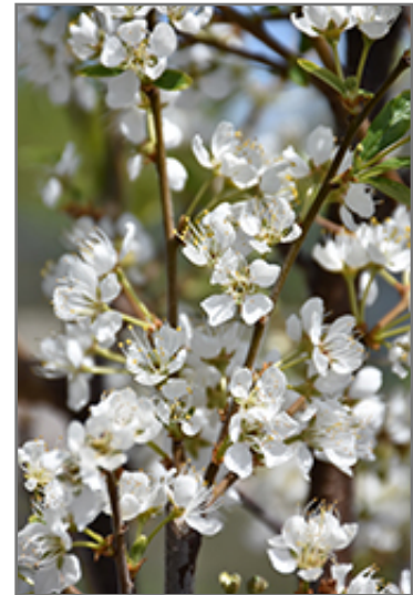
Toka Plum flowers