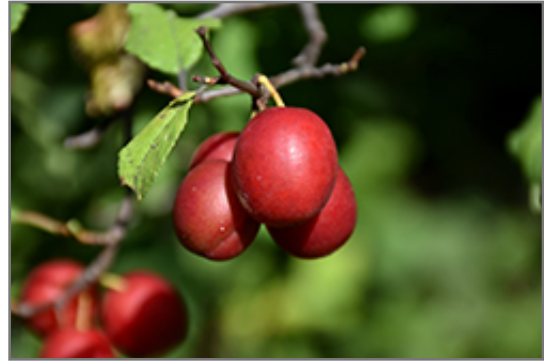
Toka Plum fruit