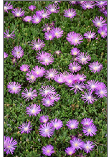
Table Mountain Ice Plant flowers

Table Mountain Ice Plant is a fine choice for the garden, but it is also a good selection for planting in outdoor pots and containers. Because of its spreading habit of growth, it is ideally suited for use as a 'spiller' in the 'spiller-thriller-filler' container combination; plant it near the edges where it can spill gracefully over the pot. Note that when growing plants in outdoor containers and baskets, they may require more frequent waterings than they would in the yard or garden. Be aware that in our climate, most plants cannot be expected to survive the winter if left in containers outdoors, and this plant is no exception. Contact our experts for more information on how to protect it over the winter months.