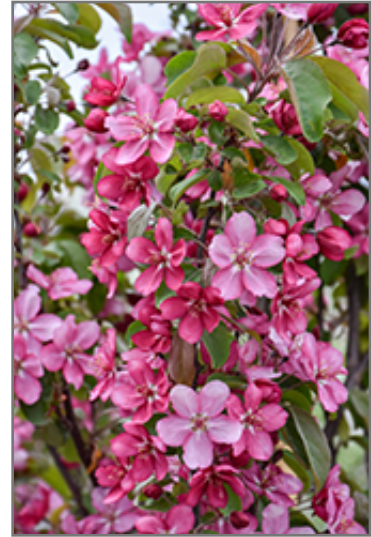
Red Barron Flowering Crab flowers