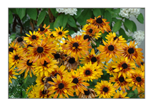
Gold Rush Coneflower flowers