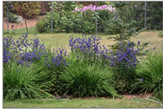
Common Monkshood in bloom

Common Monkshood will grow to be about 3 feet tall at maturity extending to 4 feet tall with the flowers, with a spread of 24 inches. It tends to be leggy, with a typical clearance of 1 foot from the ground, and should be underplanted with lower-growing perennials. The flower stalks can be weak and so it may require staking in exposed sites or excessively rich soils. It grows at a medium rate, and under ideal conditions can be expected to live for approximately 15 years. As an herbaceous perennial, this plant will usually die back to the crown each winter, and will regrow from the base each spring. Be careful not to disturb the crown in late winter when it may not be readily seen!