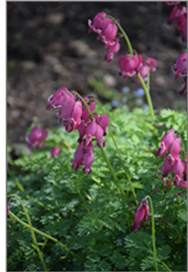
King of Hearts Bleeding Heart flowers

King of Hearts Bleeding Heart is recommended for the following landscape applications;