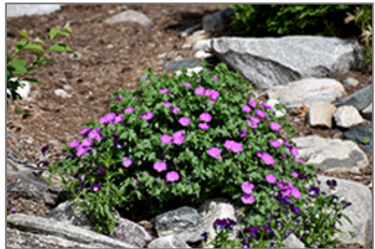
Bloody Cranesbill in bloom