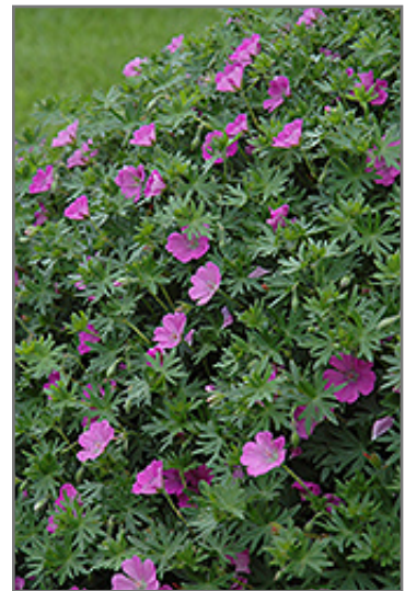
Bloody Cranesbill flowers