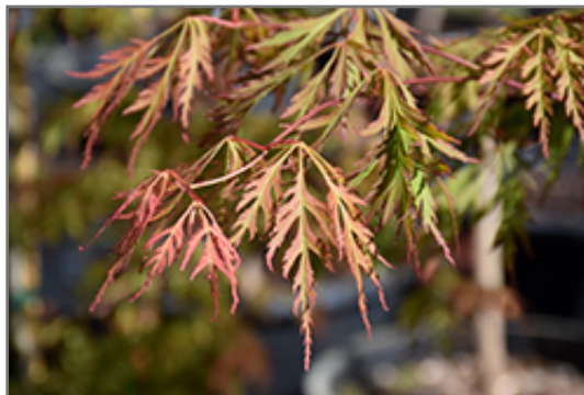
Ice Dragon Maple foliage

This is a relatively low maintenance dwarf tree, and should only be pruned in summer after the leaves have fully developed, as it may 'bleed' sap if pruned in late winter or early spring. It has no significant negative characteristics.