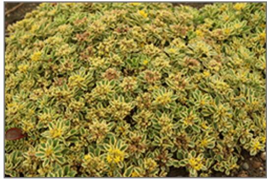
Rock 'N Low Boogie Woogie Stonecrop flowers

Rock 'N Low Boogie Woogie Stonecrop is a dense herbaceous perennial with a mounded form. Its medium texture blends into the garden, but can always be balanced by a couple of finer or coarser plants for an effective composition.