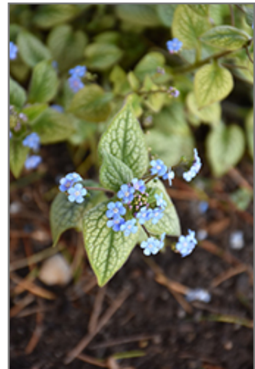
Alchemy Silver Bugloss flowers