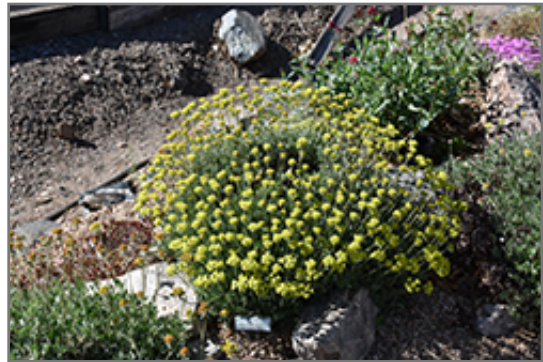
Kannah Creek Sulphur Flower Buckwheat in bloom

Kannah Creek Sulphur Flower Buckwheat is recommended for the following landscape applications;