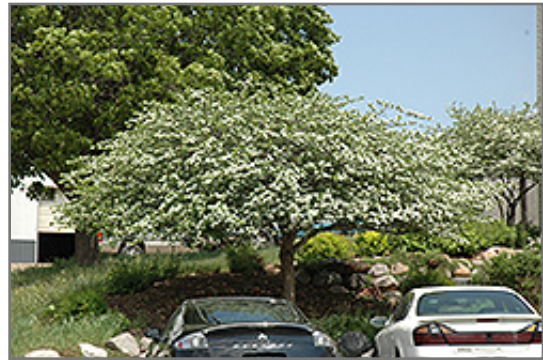
Thornless Cockspur Hawthorn in bloom