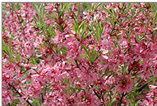
Russian Almond flowers