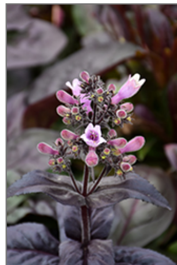
Dakota Burgundy Beard Tongue flowers

Dakota Burgundy Beard Tongue is an herbaceous perennial with an upright spreading habit of growth. Its medium texture blends into the garden, but can always be balanced by a couple of finer or coarser plants for an effective composition.