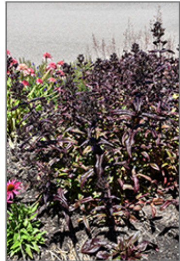
Dakota Burgundy Beard Tongue

Dakota Burgundy Beard Tongue is a fine choice for the garden, but it is also a good selection for planting in outdoor pots and containers. With its upright habit of growth, it is best suited for use as a 'thriller' in the 'spiller-thriller-filler' container combination; plant it near the center of the pot, surrounded by smaller plants and those that spill over the edges. Note that when growing plants in outdoor containers and baskets, they may require more frequent waterings than they would in the yard or garden. Be aware that in our climate, most plants cannot be expected to survive the winter if left in containers outdoors, and this plant is no exception. Contact our experts for more information on how to protect it over the winter months.