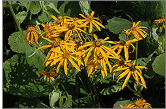
Othello Rayflower flowers