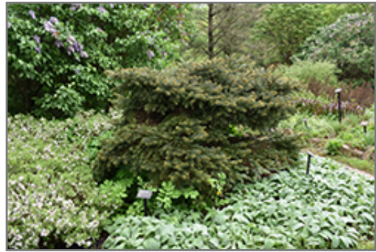
Blue Mesa Blue Spruce

Blue Mesa Blue Spruce is recommended for the following landscape applications;