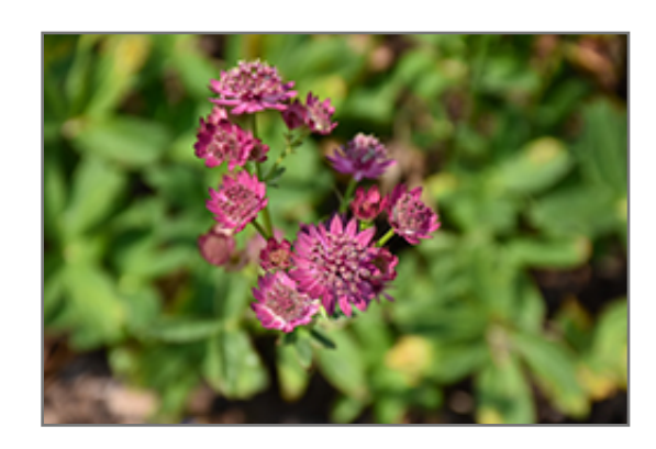
Venice Masterwort flowers