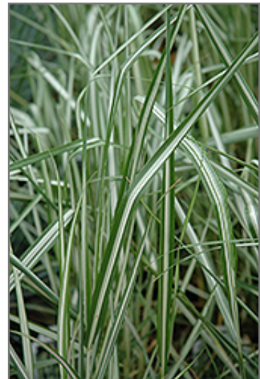
Avalanche Reed Grass foliage