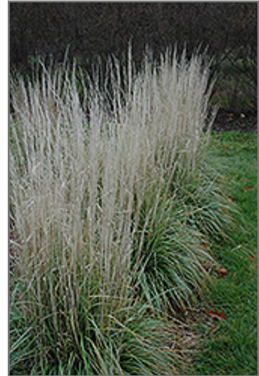
Avalanche Reed Grass in fall

Avalanche Reed Grass is recommended for the following landscape applications;