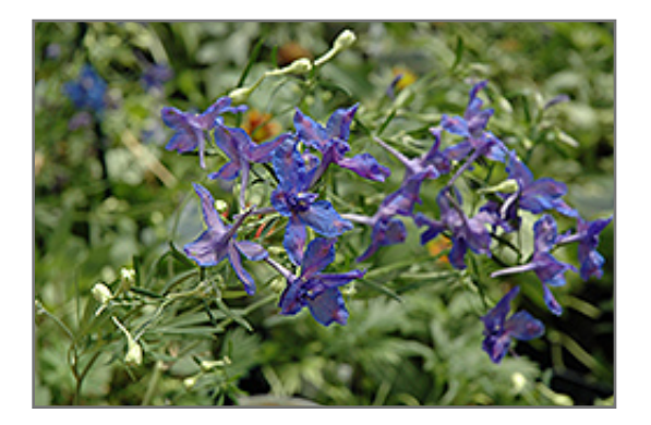
Blue Butterfly Delphinium flowers