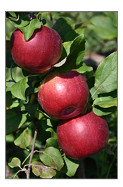
Hazen Apple fruit