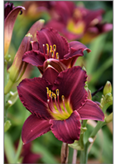
Ruby Stella Daylily flowers