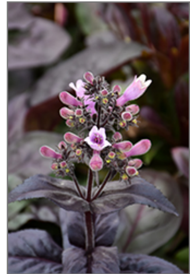
Dakota Burgundy Beard Tongue flowers

Dakota Burgundy Beard Tongue is an herbaceous perennial with an upright spreading habit of growth. Its medium texture blends into the garden, but can always be balanced by a couple of finer or coarser plants for an effective composition.