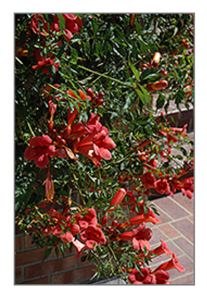
Flamenco Trumpetvine in bloom